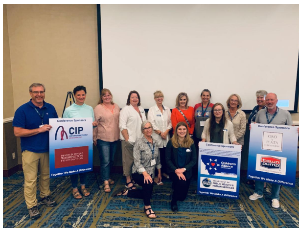
Local Program Leaders